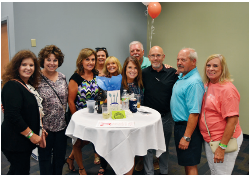
(Above and top right) As a community-focused event, Taste of the Town attracts a large crowd each year and has grown to be a summer staple in High Point. (Bottom right) FosterHobbs Coffee Roasters offered eventgoers tastes of their locally-roasted hot and cold brew.

93.1 The Wolf City of High Point Dixon Hughes Goodman, LLP Hartley Drive Family YMCA High Point Convention & Visitors Bureau International Market Centers Pennybyrn at Maryfield PIP Triad & Triad Signs ServiceMaster Clean Sharrard, McGee & Co., PA Shelba D. Johnson Trucking The High Point Enterprise