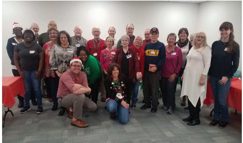
Volunteers from Hospice of the Piedmont and Hospice of Randolph enjoyed their first combined social to celebrate the holiday season.

Most often, volunteers devote their visits to emotional care and companionship, as well as providing respite for caregivers. Other volunteers help with transportation or provide clerical support including filing, assembling patient handbooks, answering phones and greeting visitors at our inpatient facilities. Volunteers are asked to spend a minimum of one hour a week with their assigned patient. In order to volunteer, you must be at least 18 years old, pass a criminal background check and an initial TB test, attend an information session and training session and commit to the program for at least one year.